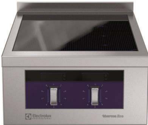
588013 (MACBABDOAO) Infrared Top, 2 zones, one-side operated with backsplash